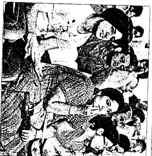
Students and parents keep a watch on the LCD screen where the number of vacant seats were displayed at PEC University of Technology in Sector 12, Chandigarh, on Wednesday.